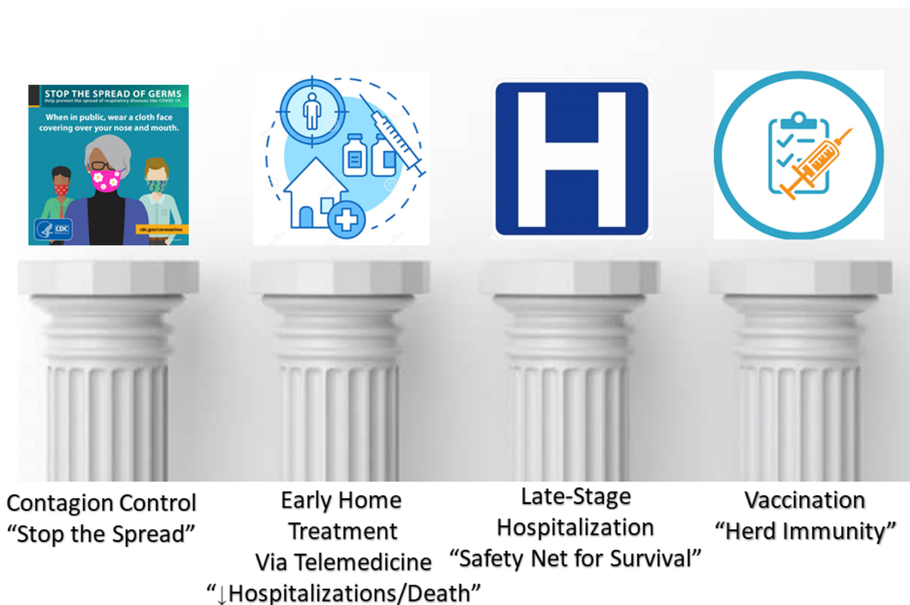
Fig. 1. The four pillars of pandemic response to COVID-19. The four pillars of pandemic response to COVID-19 are: 1) contagion control or efforts to reduce spread of SARS-CoV-2, 2) early ambulatory or home treatment of COVID-19 syndrome to reduce hospitalization and death, 3) hospitalization as a safety net to prevent death in cases that require respiratory support or other invasive therapies, 4) natural and vaccination mediated immunity that converge to provide herd immunity and ultimate cessation of the viral pandemic.

erson et al., 2020; Xu et al., 2020). Masks for all unaffected contacts within the home as well as frequent use of hand sanitizer and hand washing is mandatory in the setting when one or more family members falls ill. Sterilizing surfaces such as countertops, door handles, phones, and other devices is advised. When possible, other close contacts can move out of the house and seek shelter free of SARS-CoV-2. Findings from multiple studies indicate that policies concerning control of the spread SARS-CoV-2 are only partially effective and extension into the home as the most frequent site of viral transfer is reasonable (Hsiang et al., 2020; Xiao et al., 2020). One of the great advantages of home treatment of COVID-19 is the ability of an individual or family unit to maintain isolation and complete contact tracing. If therapy is offered in the home with delivery of medications, then trips to urgent care centers, clinics, and hospitals can be reduced or eliminated. This limits spread to drivers, other patients, staff, and healthcare workers. On the contrary, therapeutic nihilism on the part of primary care physicians and health systems drives anxiety and panic among patients with acute COVID-19 who feel abandoned, making them more likely to break quarantine and seek aid at urgent care centers, emergency rooms and hospitals.